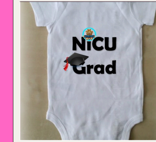
Nicu Graduate Program