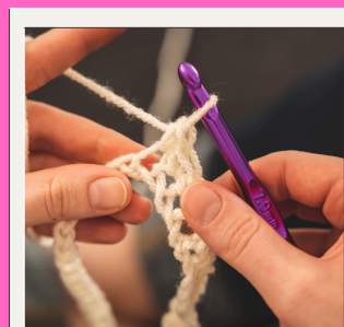
NiCU Family Activities