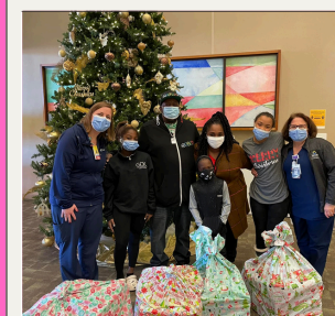
Holiday Hope Campaign